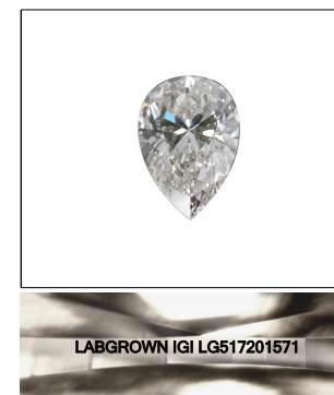
LASERSCRIBE SM Sample Image Used